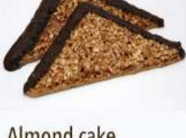
Almond cake whit chocolate