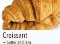
Croissant + butter and jam