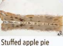
Stuffed apple pie