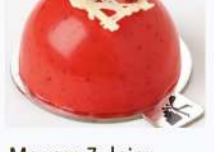
Mousse Zuleica vanilla and rasberry