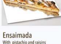
Ensamada With pistachio and raisins