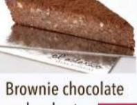
Brownie chocolate and walnuts