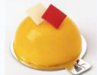
Mousse Caribe mango, passion fruit, coconut