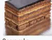
Opera cake with coffee