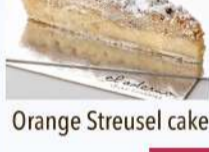
Orange Streusel cake