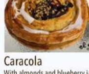
Caracola With almonds and blueberry jam