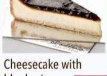
Cheesecake with blueberries