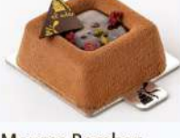
Mousse Bombon milk chocolate