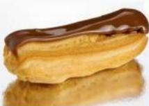
Eclair with Chocolate