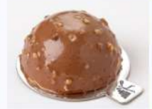
Mousse Ferrero hazelnuts, chocolate