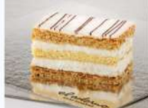
Milhoja whit cream and Fondat