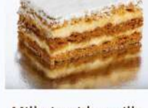
Milhoja with vanilla cream