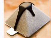
Mousse Teide dark chocolate, passion fruit