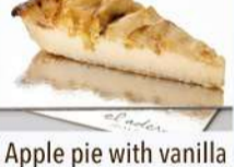
Apple pie with vanilla cream