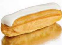
Eclair with fondant