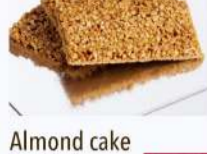
Almond cake With biscuit