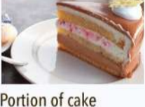
Portion of cake of the day