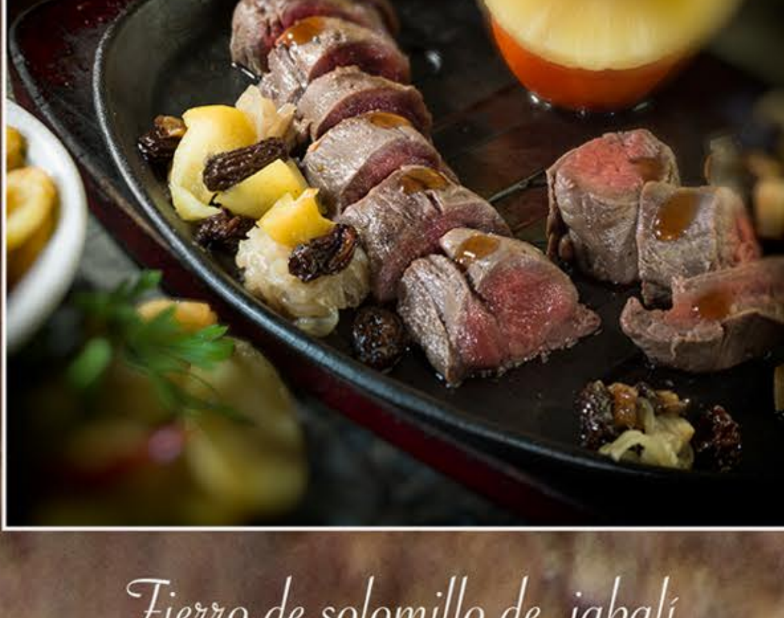
Fierro de solomillo de jabalí Wildschweinefilet vom heissen stein Sizzling board on a hot plate with potatoes