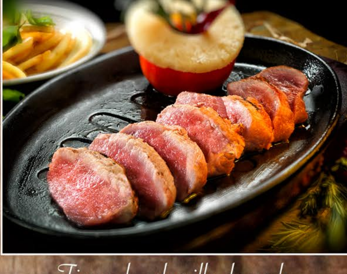
Fierro de solomillo de cerdo Schweinefilet vom heissen stein Sizzling pork served on a hot plate