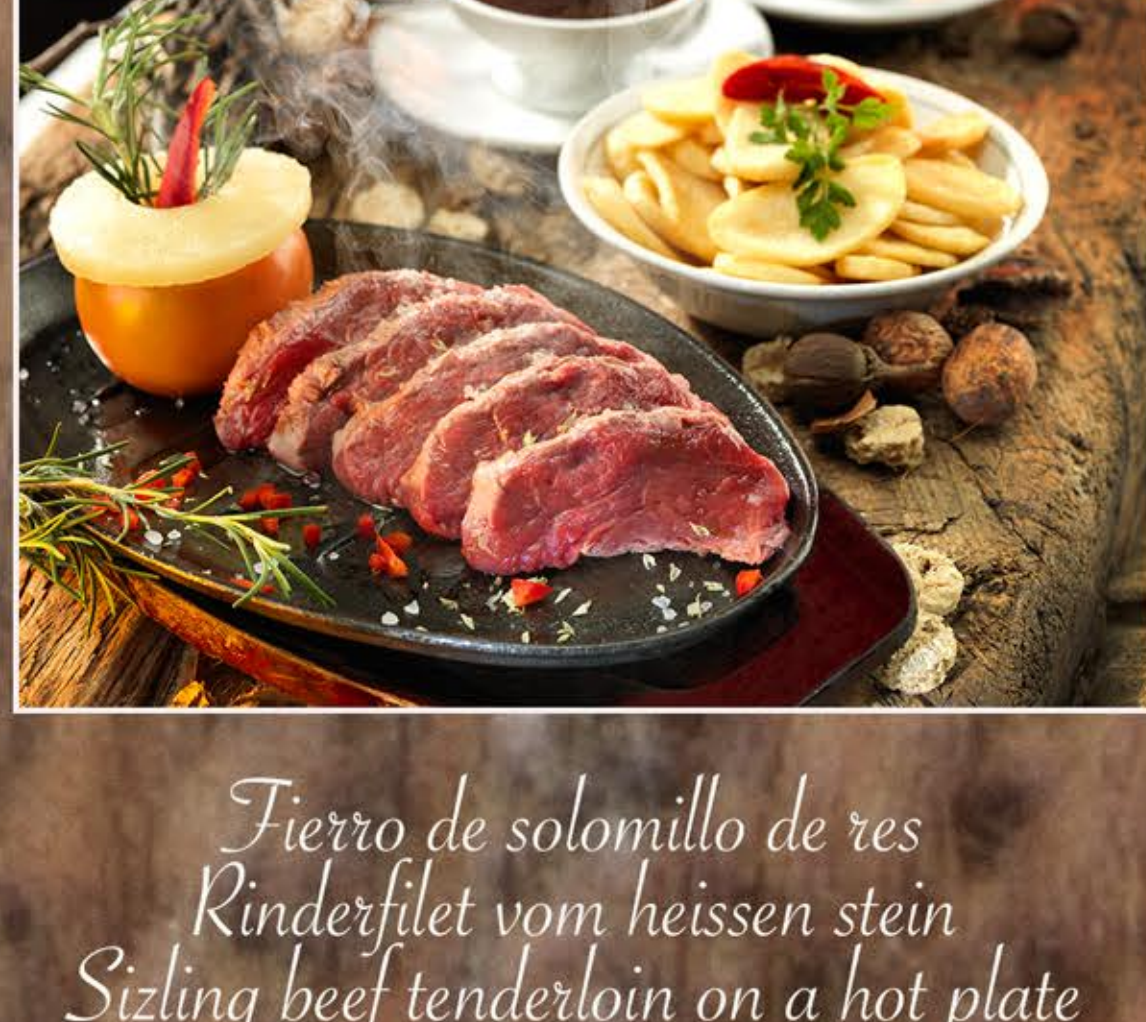
Fierro de solomillo de res Rinderfilet vom heissen stein Sizzling beef tenderloin on a hot plate