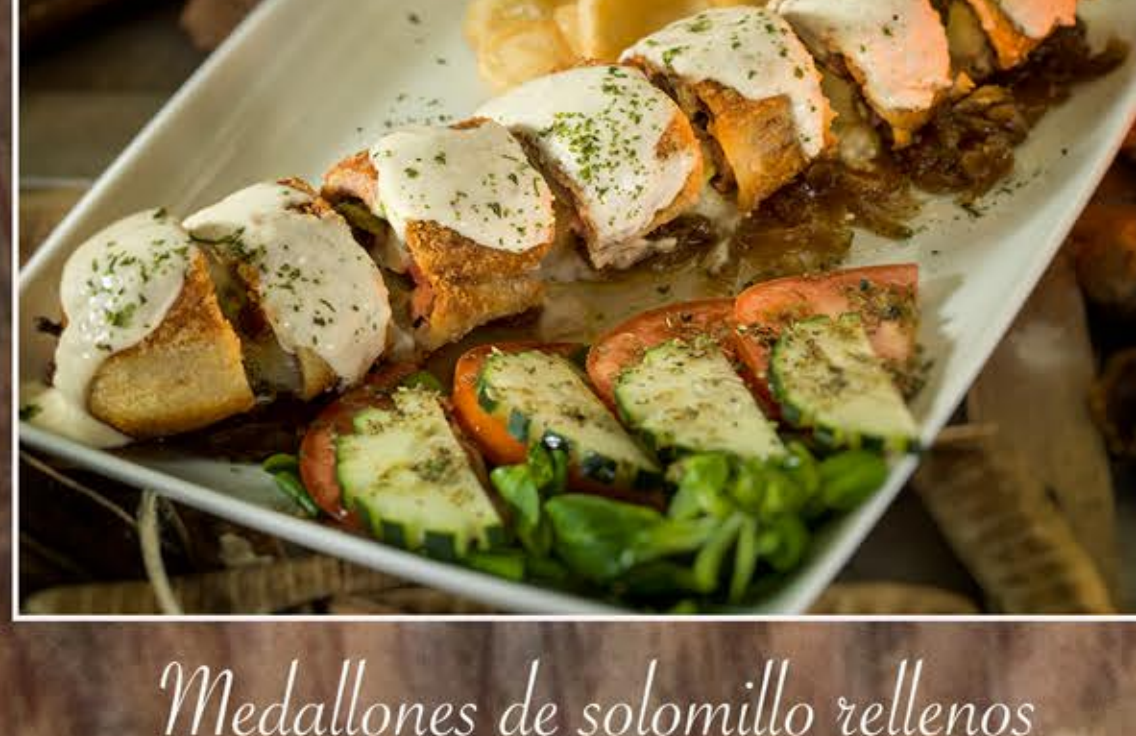
Medallones de solomillo rellenos Gefüllte medaillons vom rind Beef medallions stuffed with cheese and avocado