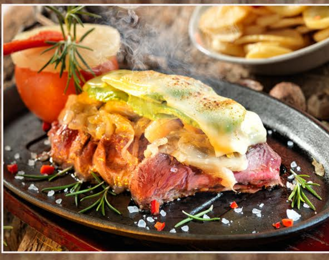
Fierro de solomillo Guayanés Guayanés vom heissen stein Sizzling Guayanés served on a hot plate