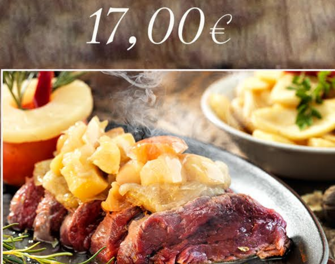
Fierro de solomillo encebollado con manzanas Rinderfilet mit apfel vom heissen stein Sizzling with apples served on a hot plate