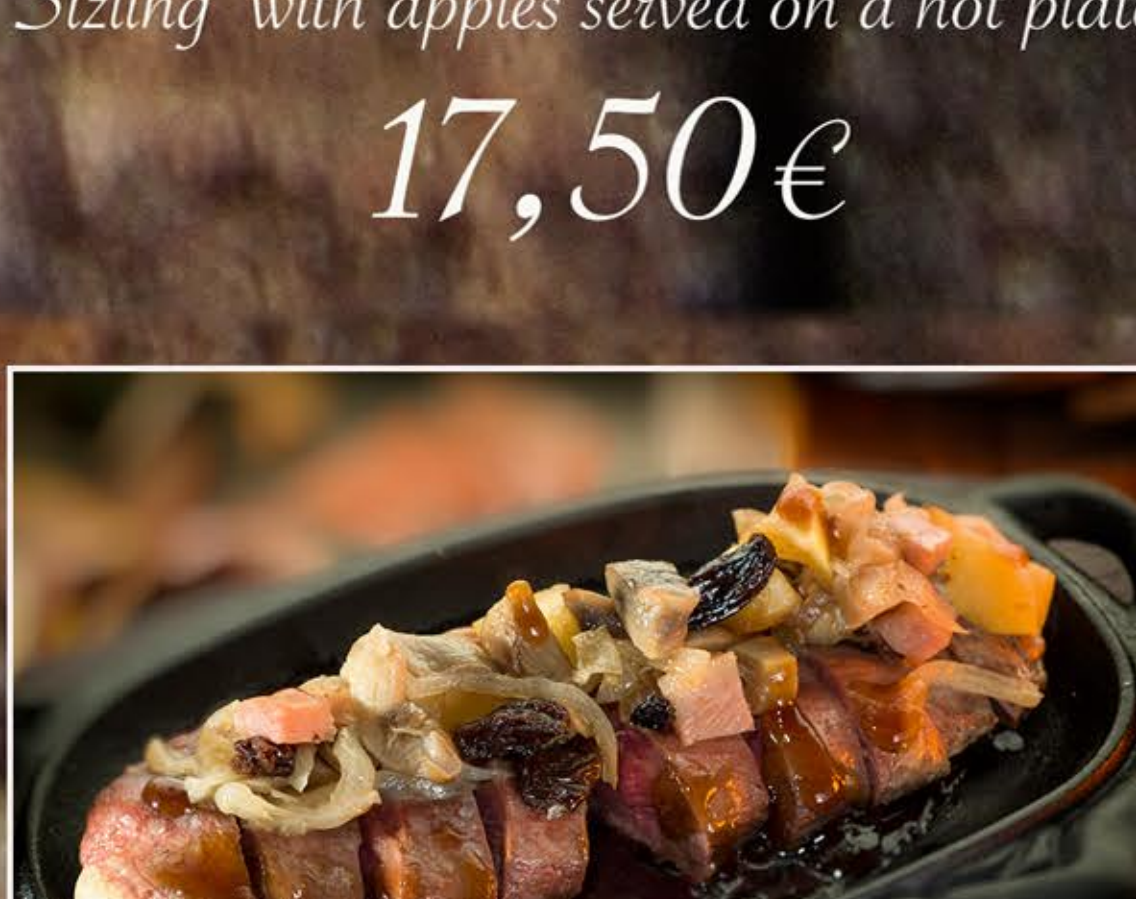
Fierro de magret de pato Entenbrust vom heissen stein Sizzling duck on a hot plate with potatoes